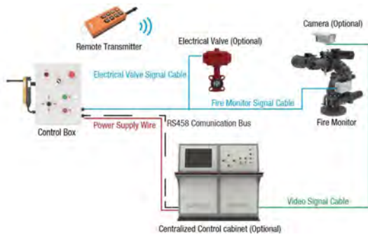
ICS01 CONTROL SYSTEM WIRING